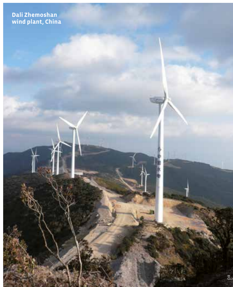
Dali Zhemoshan wind plant, China