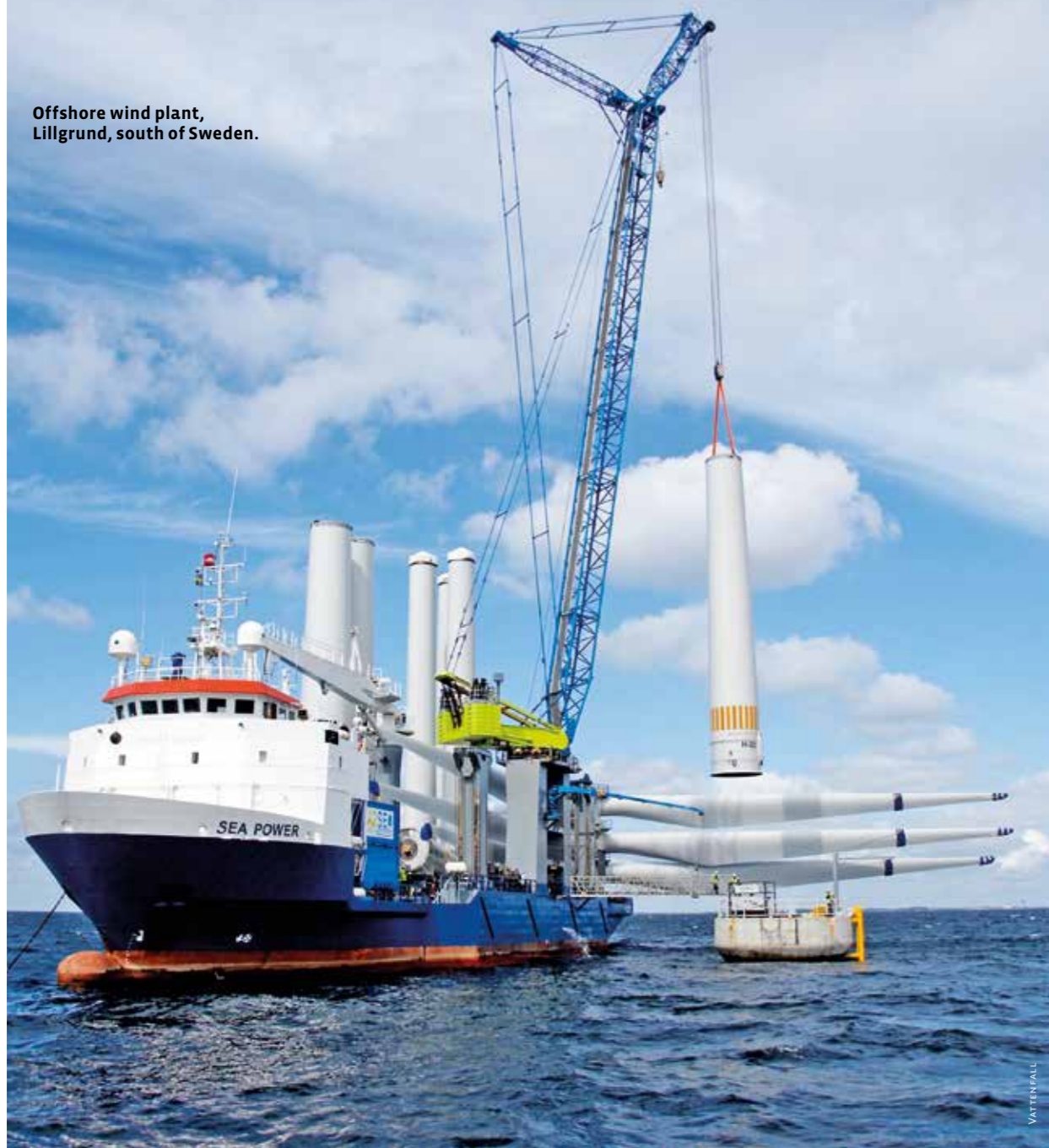
Offshore wind plant, Lillgrund, south of Sweden.

the two of them), as well as Kriegers Flak (606 MW) off Denmark and Seamade (487 MW) off Belgium.