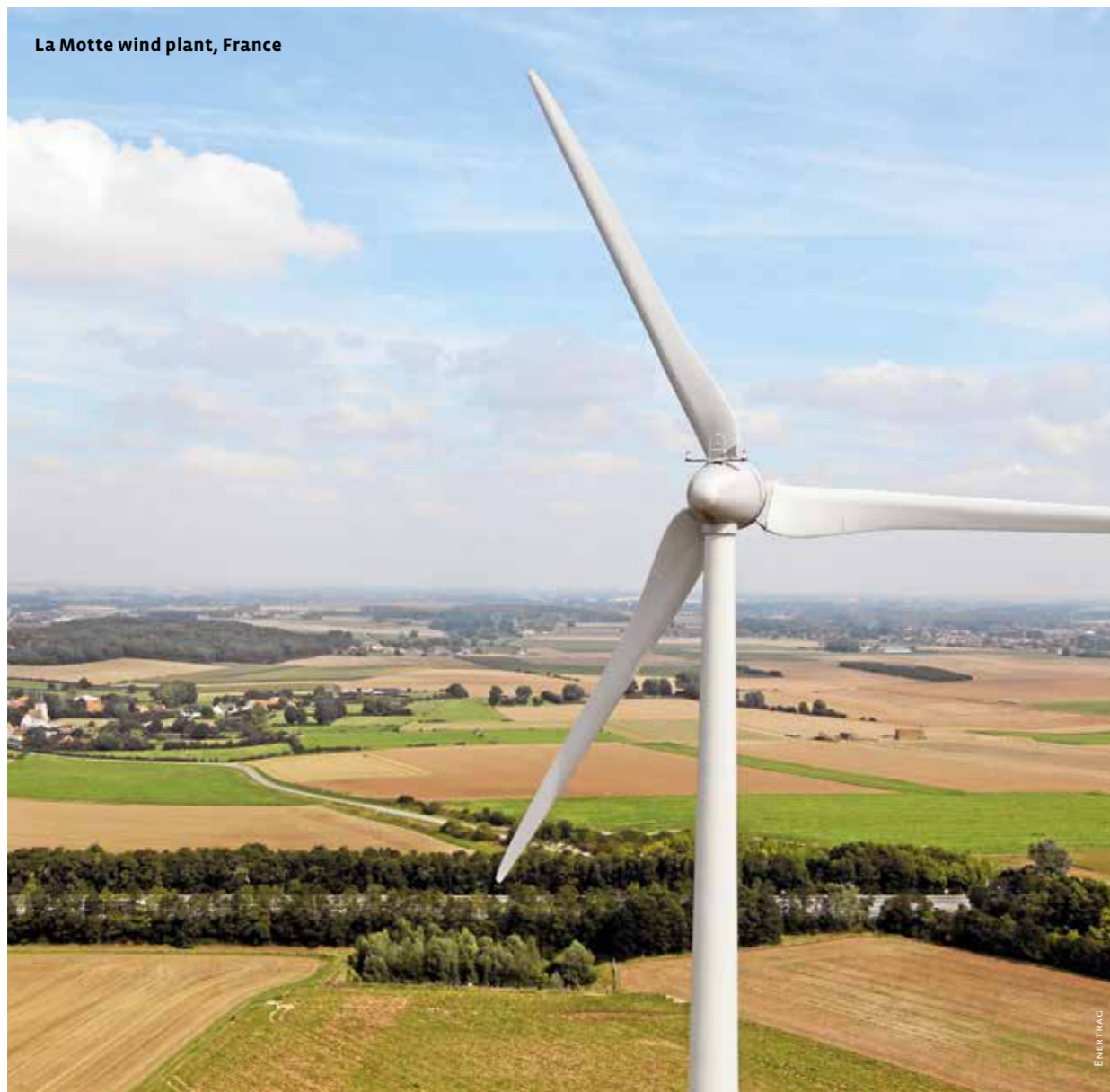
La Motte wind plant, France

two offshore wind farms from tenders is unlikely to happen any earlier than 2021 (the first was launched on 11 July 2011). Until that time, the French wind energy market will be landlocked. According to the 2018 Renewable Electricity Panorama produced by RTE, Enedis, the Syndicat des énergies renouvelables and others, France passed its 15 GW installation target at the end of 2018, with combined capacity to date of 15 108 MW. That makes 2018 the second best year for the sector with 1 558 MW connected to the grid, despite having dropped from its 2017 level. The last quarter witnessed the best progress ever made by the wind turbine