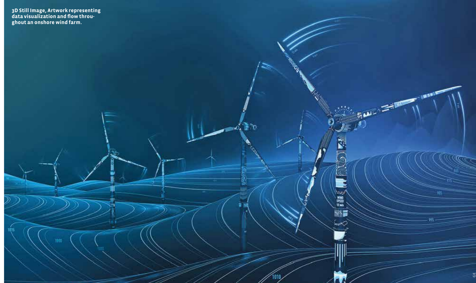
3D Still Image, Artwork representing data visualization and flow throughout an onshore wind farm.

Further down the value chain, major industrial issues such as digitalisation are also emerging. This term, which shook the industry in 2018, can be defined as transferring data sharing and processing to a virtual world, which enables the quantity of data exchanged to be increased and moreover exchanged instantly. The wind turbine industry's digitalisation efforts will streamline machine production and manage their integration into electricity grids. The industry players see digitalisation as a way of cutting technology production costs, primarily by ensuring that each MWh produced can be sold at the best possible price. This is aided by the fact that digitalisation is also under development for the purposes of electricity storage. Digitalisation coupled to a battery is used to define the best time to inject a wind energy electron into the grid, which not only means waiting for the time that the electron is most needed by the global electricity market but also when it commands the best price for its producer. The Batwind battery that has been installed on the Hywind Scotland Wind Farm really illustrates this point. The wind