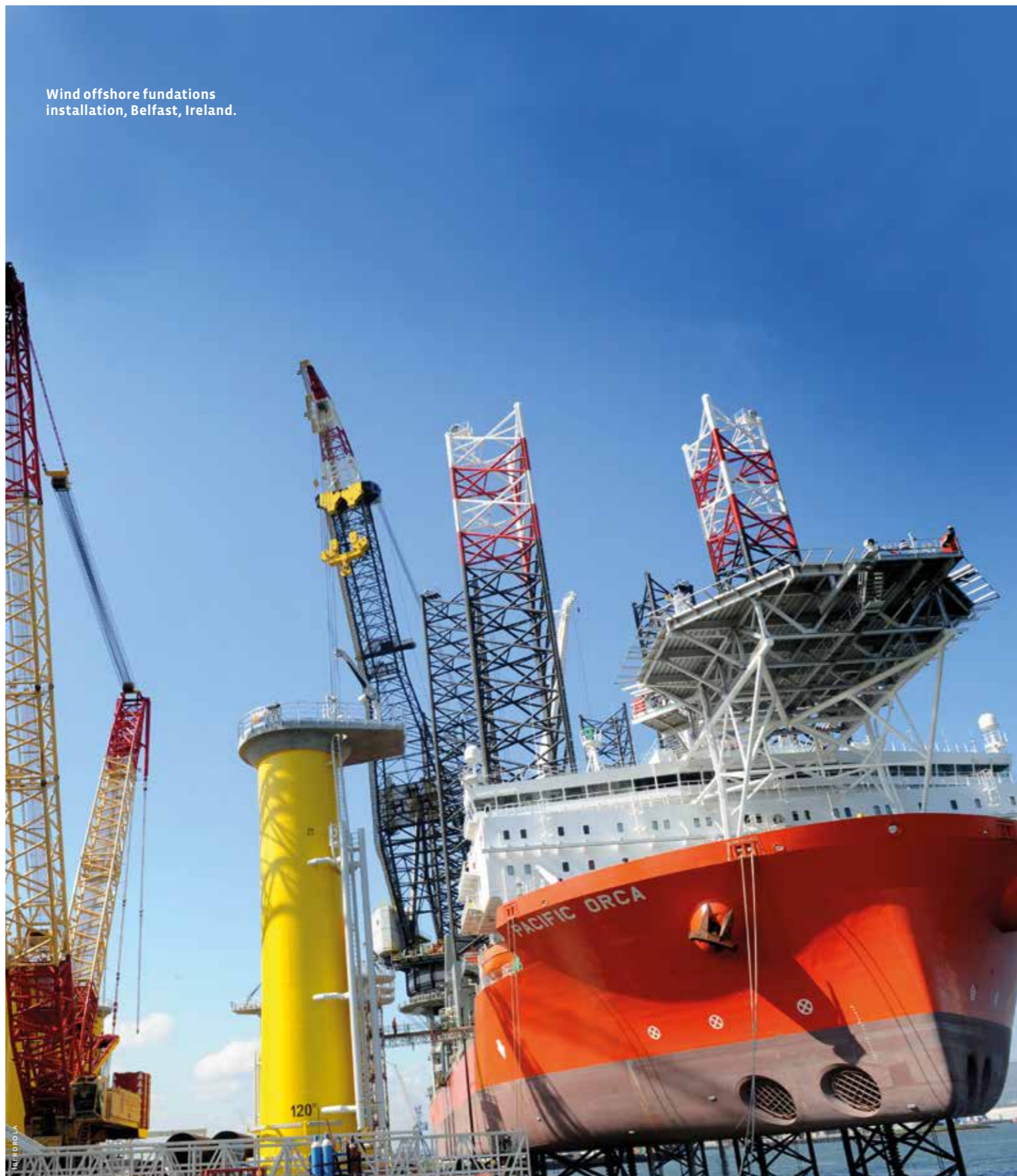
Wind offshore foundations installation, Belfast, Ireland.